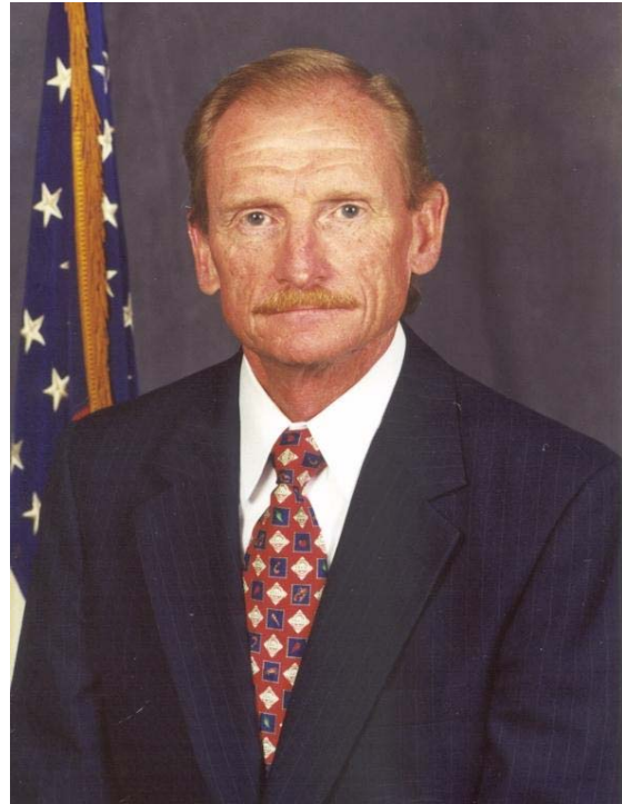
Assistant Chief Charles V. Rowe

In closing, 2008 has been a productive year in that the finalization of some projects and plans has allowed us to move to the next step. The next step appears to be the completion of our staffing and training goals that should be accomplished in 2009. The impact of increased manpower should be felt during the next few years. Full implementation of the multi-year plan should allow us increased presence in the neighborhoods and will allow the Police Department to continue efforts to establish partnerships with the community to help promote safety and prevent crime. With a combined and unified approach, the community and Police Department can make an impact on the quality of life in Columbus.