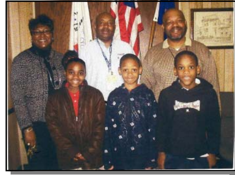
The METRA Transit Staff and their breakfast buddy during onsite visit at METRA Transit System.

Providing outstanding transportation service to the public is an important activity that is provided at METRA Transit System. METRA also extends their hearts to some wonderful students at the Downtown Elementary School through their mentoring program called "Breakfast Buddy". The students are mentored by a METRA staff person and are involved in learning activities throughout the year.