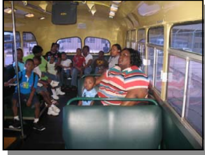
Niesy's Kiddie Korner watching the Rosa Parks' Movement