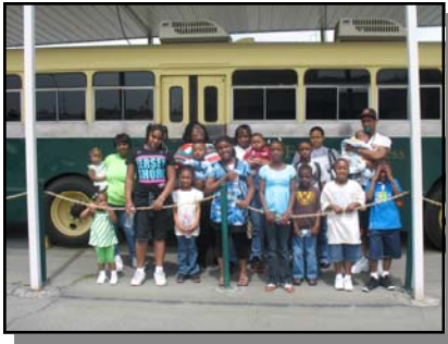
Niesy's Kiddie Korner

Experience what it was like to be on a segregated bus in the 1950's in the south. In the 1950's, public transportation was the cheapest way to get around town. Black Americans rode the buses daily all across the City. The emotional price they had to pay was no small matter. In the fall of 1955, an everyday person just like you had seen and suffered as much humiliation as she was willing to take. Rosa Parks decided that something had to change.